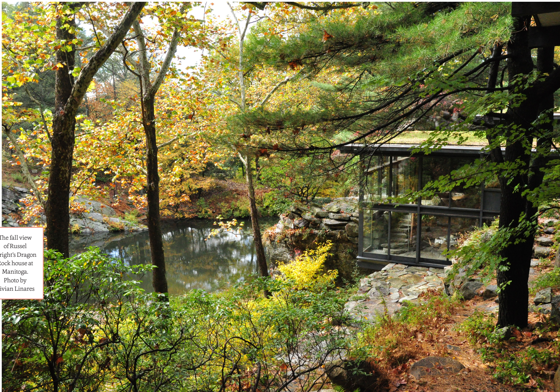
The fall view of Russel Wright's Dragon Rock house at Manitoga.