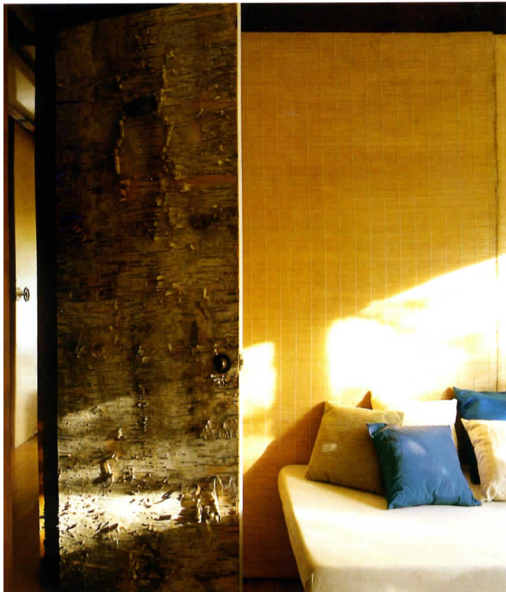
Top: above a table designed by Wright, a print of Jean-Jacques Audubon's owls keeps vigil over the bed, with its hand-loomed American cover. Above: the guest bedroom has a door lined with birch bark, while Asian reed matting – one of many Eastern influences here – covers the walls