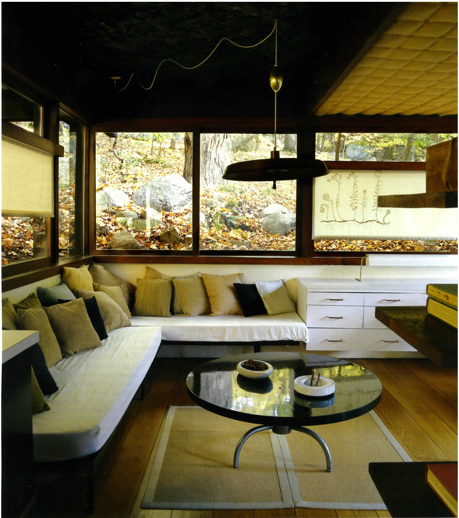
Above: a circular coffee table by Wright sits on Eastern-style mats underneath a ceiling of, on one side, dark-green epoxy marked with the impressions of pine needles and other forest materials, and on the lighter side, of burlap. The ferns decorating the window blinds were painted by Wright