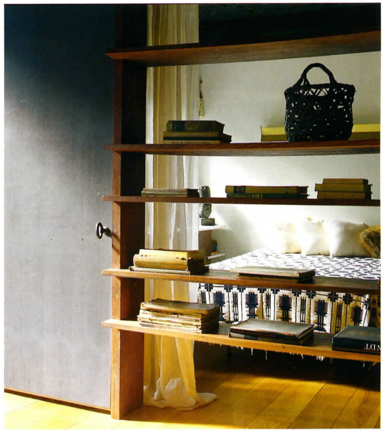
This page, clockwise from top left: the 1958 chair is by George Nelson for Herman Miller; looking from the studio's terrace towards the main house, which with its seeded green roof melts into the landscape; between the master bedroom and work space, a door leads on to the terrace; the quarry pond