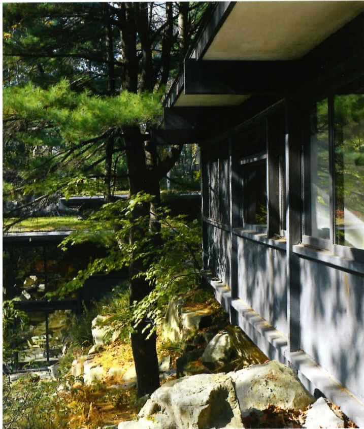
Top: a Korean silk ancestor portrait hangs on a door in the hallway that opens into the bathroom. Above: the studio sits comfortably in its rocky surroundings, at a higher level than the main house, which is visible to the left