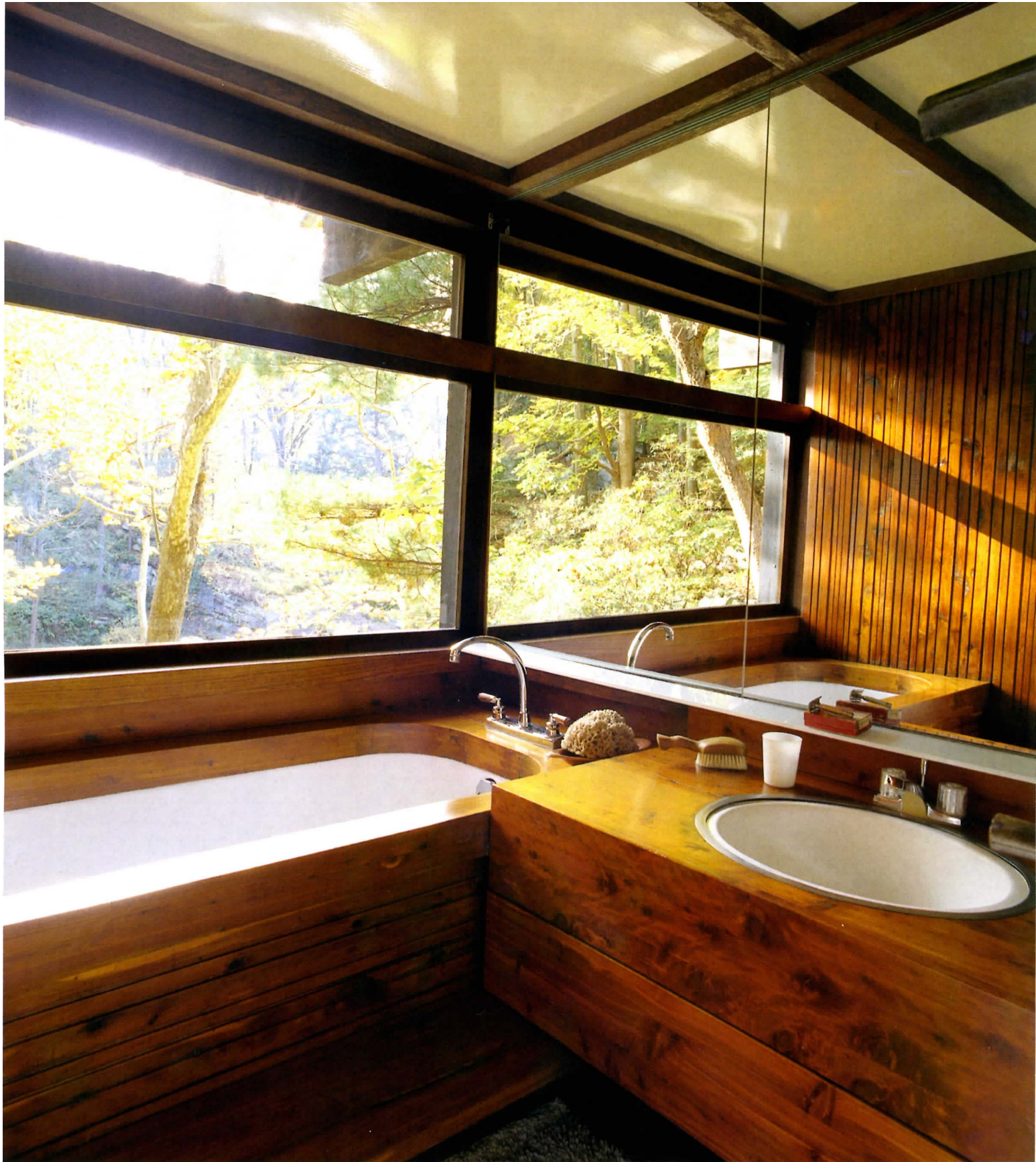
Above: the red cedar of the bathroom lends it great warmth, while a wall of mirror increases the sense of space and extends the view. The window above the deep tub overlooks the quarry pond, waterfalls and woodland