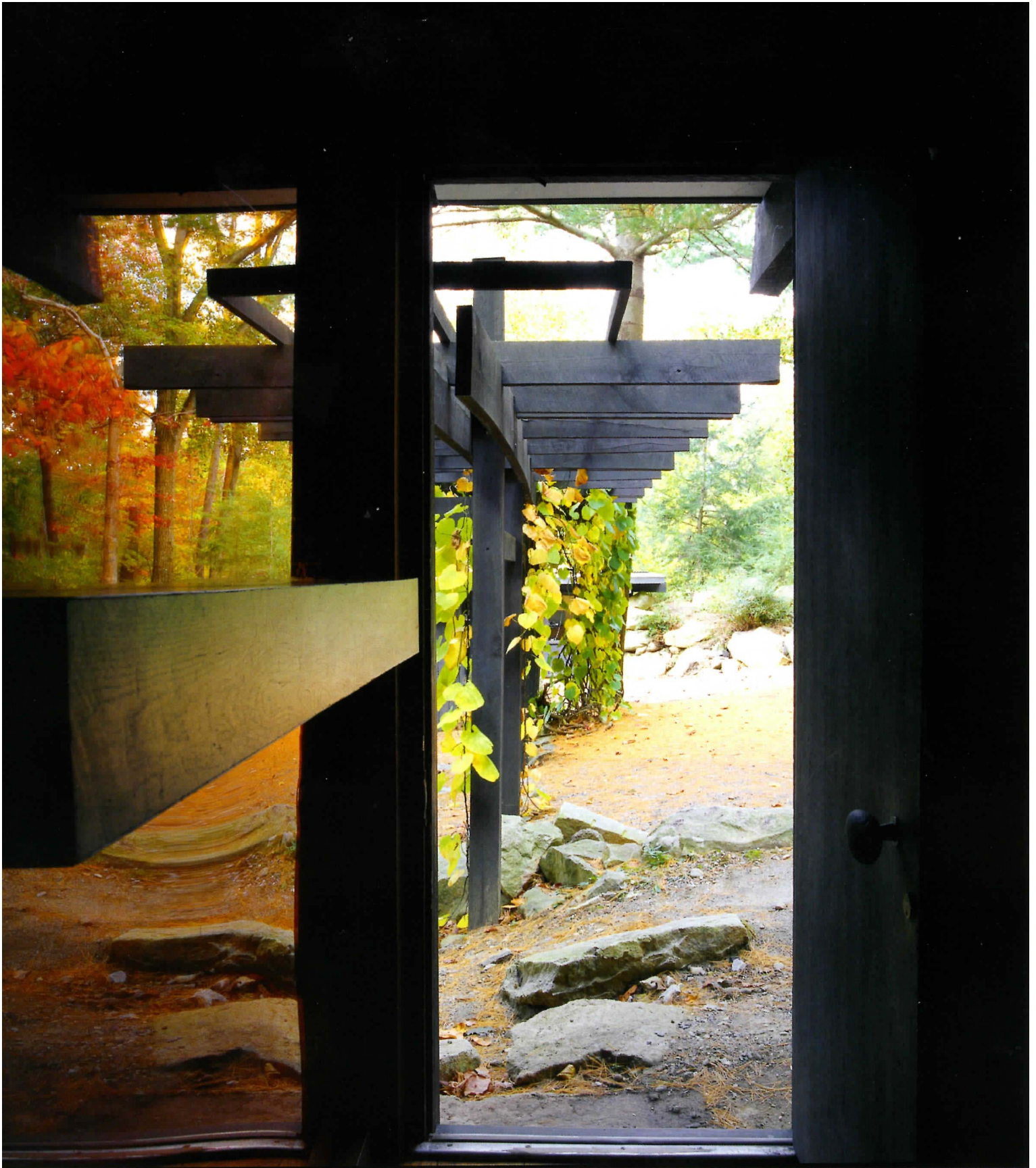
Above: a simple pergola planted with the native Dutchman's pipe vine connects the studio to the main house. A reflective panel inside the studio's entrance mirrors the leafy view outside the door. Opposite: an Asian conical hat hangs on the far wall of the narrow hallway, which leads to the open main space