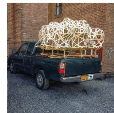
Sanctuary (construction) , 2015 Flat reed and bamboo poles