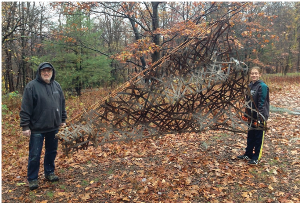
Artist with Son , 2015