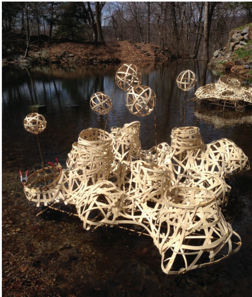
Sanctuary , 2015 Flat reed and bamboo poles 8 x 8 x 4'