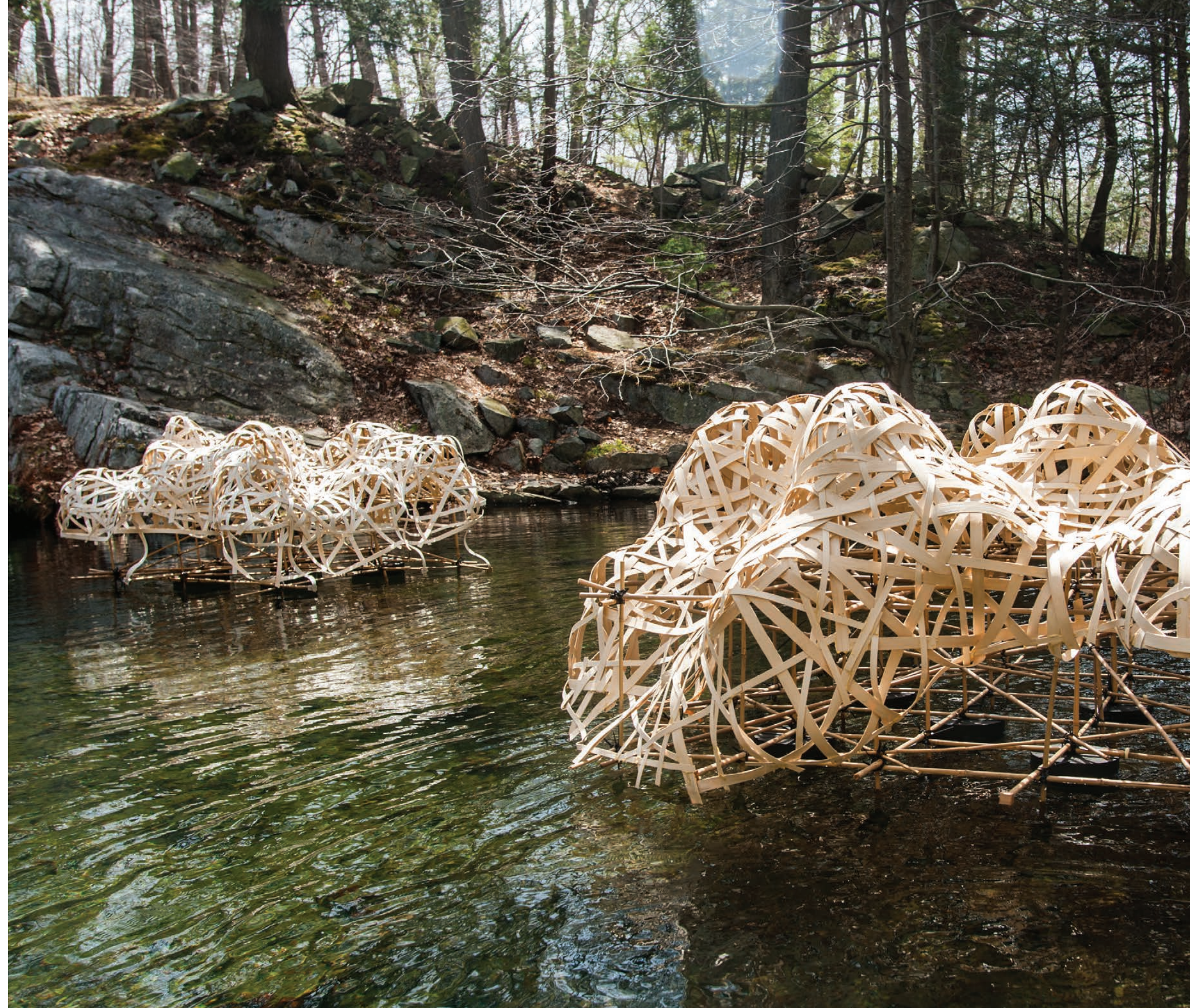
Following Pages Sanctuary , 2015 Flat reed and bamboo poles 25 (diam) x 4'