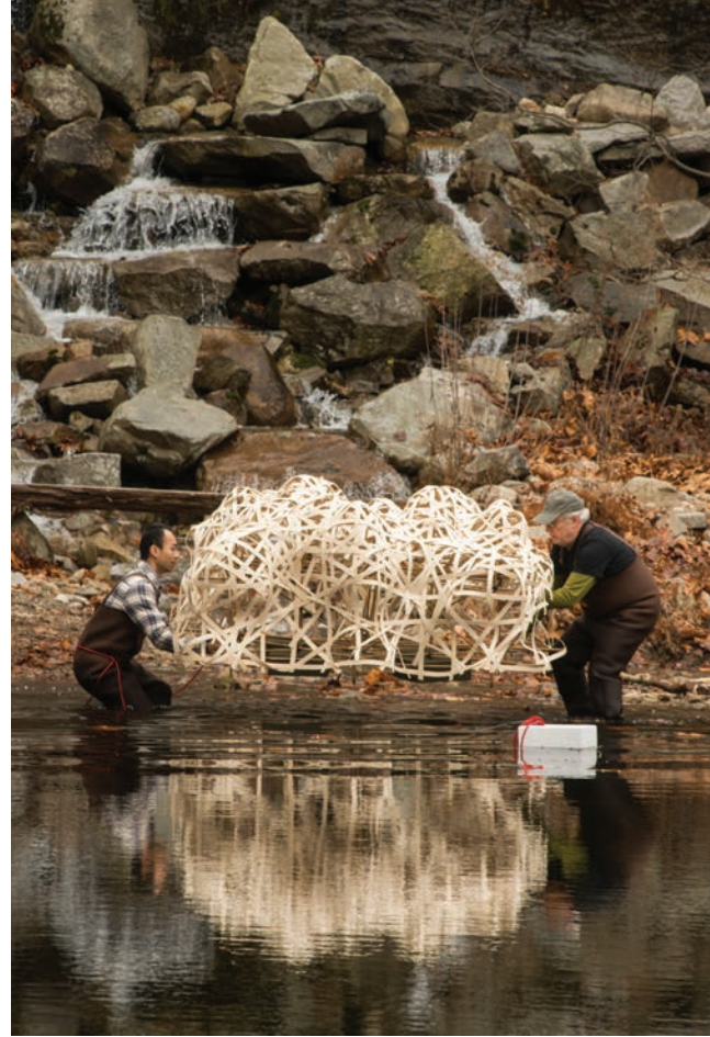
Sanctuary (sectional float test in Hudson River), 2015 Flat reed and bamboo poles 12 x 4 x 4'