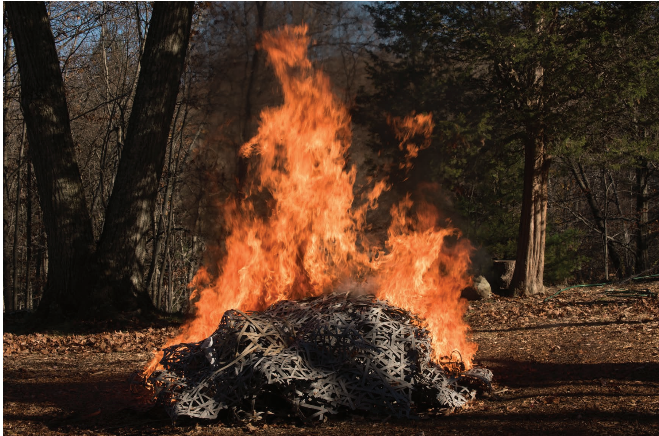
Sanctuary Deinstallation , 2015 Flat reed and bamboo poles Variable Dimensions