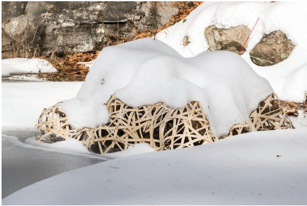
Sanctuary (Igloo) , 2015 Flat reed and bamboo poles