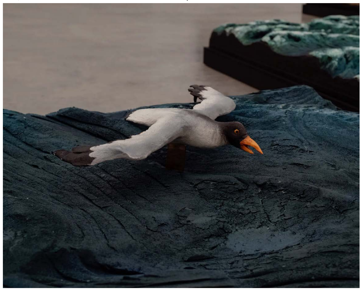
Detail of Gilardi's "Mare" (1967), with sea gull.

Gilardi, now 79 and living in Turin, was intellectually peripatetic, dropping in and out of the art world, pursuing ideas from ecology to digital technology to community-based art. But over a 60-year career, the backbone of his production remained nature carpets, a genre to which he returned in almost every decade, always with an ecological message delivered with puckish delight: vividly colored, slightly cartoonish, sometimes over-the-top pieces that eschewed the controlling hand of a master. He was a Geppetto, an anti-Michelangelo carving a cheap material incapable of the refinement of a masterwork. He seemed to mock the object as he made it.