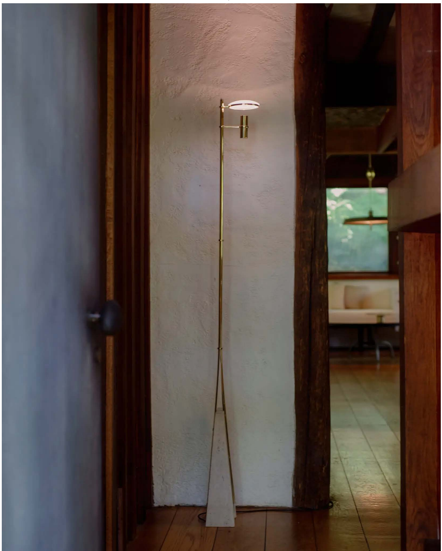
The Magnifier Floor Lamp in brass and travertine by Formafantasma.