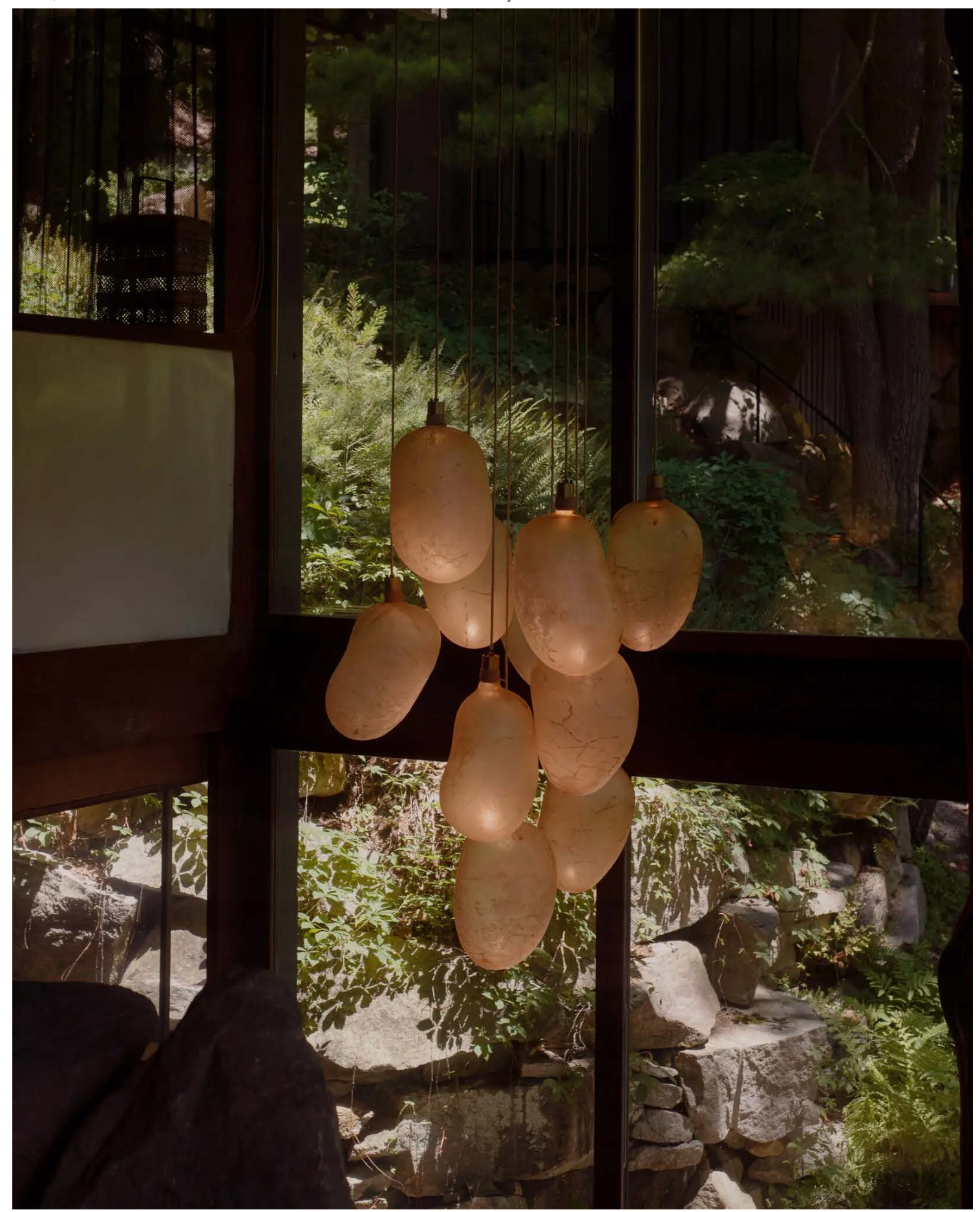
The Bladder Chandelier by Formafantasma in the double-height dining area.