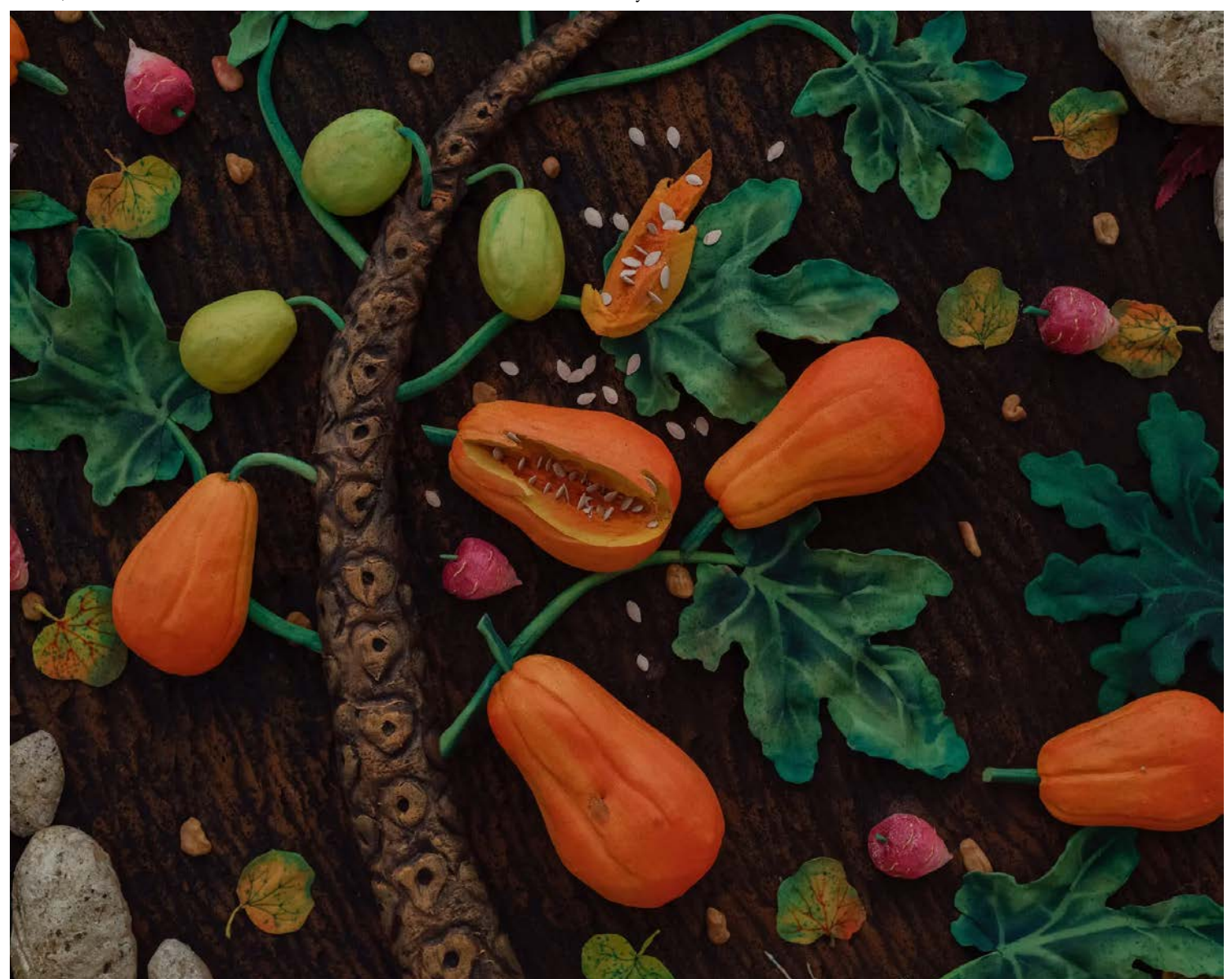
Detail of "Papaya e Pitaja" (2018) by Piero Gilardi at Magazzino. His Technicolor landscape of fruits and vegetables is carved from synthetic industrial materials, polyurethane painted with synthetic pigment.