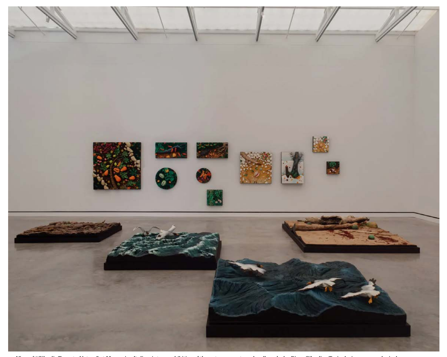
View of "Gilardi: Tappeto-Natura" at Magazzino Italian Art, an exhibition of the nature carpets and wall works by Piero Gilardi, a Turin designer, an ecological message delivered with puckish delight.

At Magazzino, Gilardi carved a rough-hewed Technicolor landscape of fruits and vegetables from the most synthetic industrial materials, polyurethane painted with synthetic pigment. On thick contoured foam beds, he glued sea urchins, pumpkins, corn cobs, grapes, even the occasional armadillo passing through. The "furniture" allowed families to live with the idea of the outdoors in their living rooms, reconnecting life in the city to an increasingly fragile and defensive nature. He was introducing nature into the over-industrialized world that was killing it.