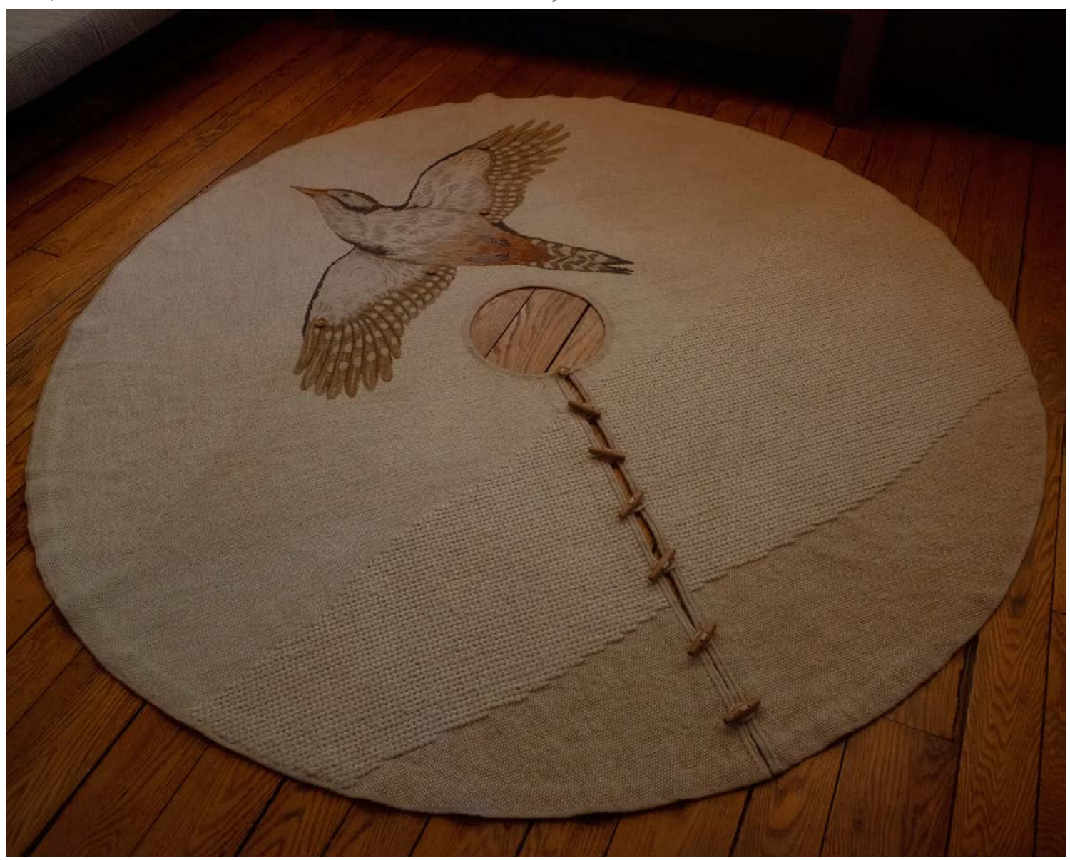
Migration \ "Pettirosso \ Rug" \ in \ wool \ by \ Formafantas main \ the \ Russel \ Wright \ House. \