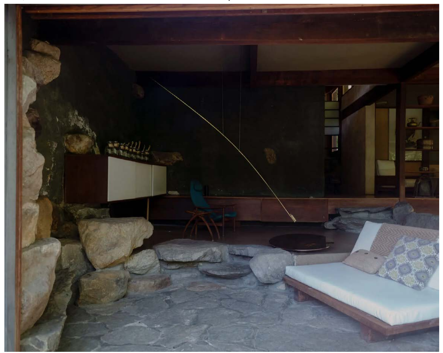
Bone Jug Series (left) and Reflector Floor Lamp (right) by the Milanese design firm Formafantasma in the Russel Wright House at Manitoga. The designers placed their organic product designs within the organic midcentury structure.